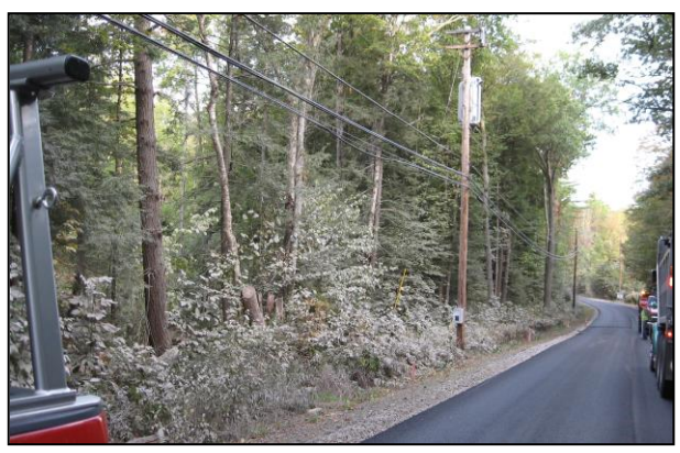
Poor Dust Control is a Public Health Risk, and Impacts Vegetation, and the Environment.

Fugitive dust is an air pollutant generated during commercial or business activities such as sand, gravel and rock-mining operations, paving operations, parking lot and roadway cleaning, and earthmoving operations. It is also generated during loading and unloading of materials, wind-blown from material stockpiles and exposed soils, and from vehicular traffic.