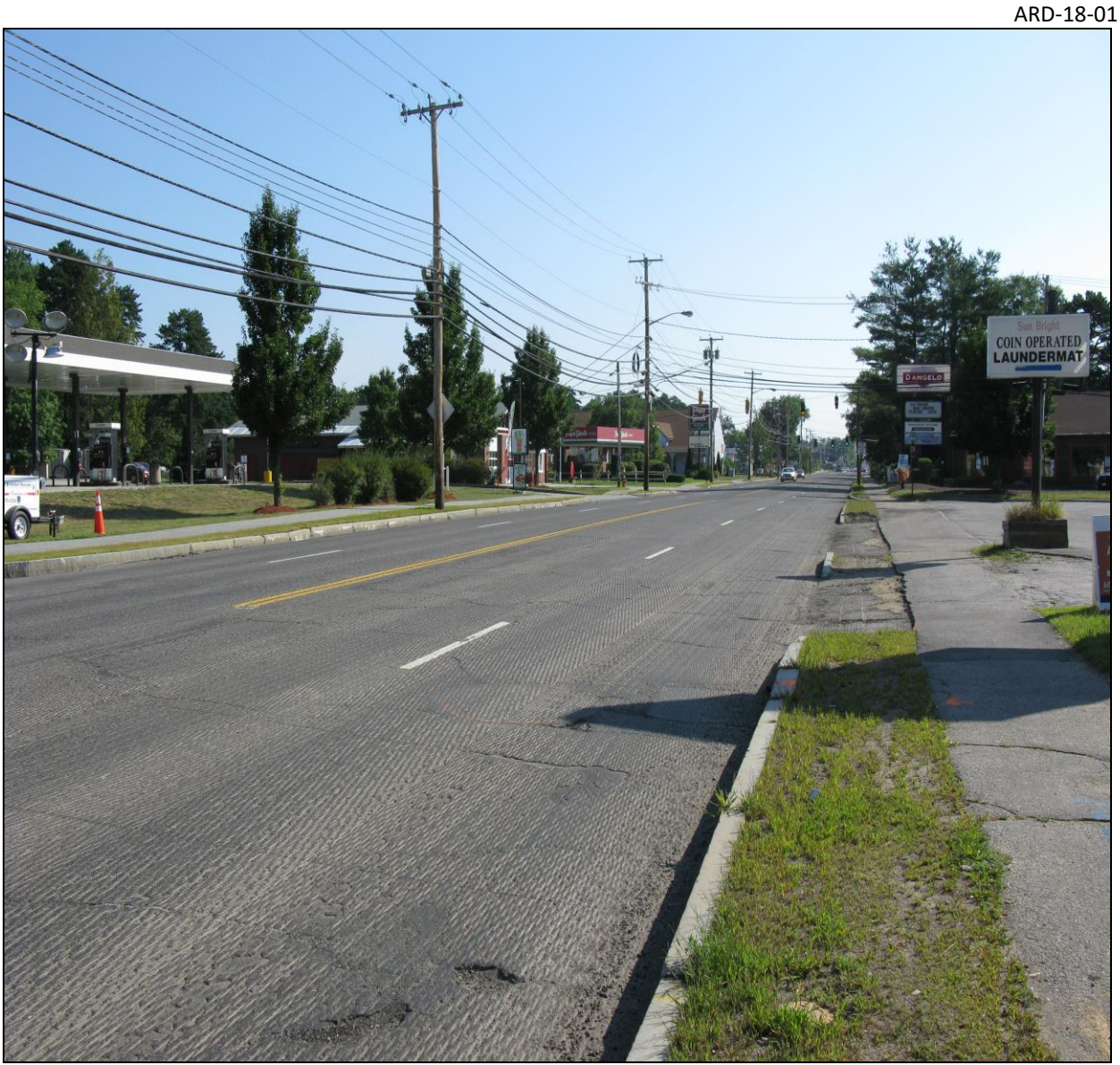
Example of properly-cleaned roadway to eliminate dust from traffic.