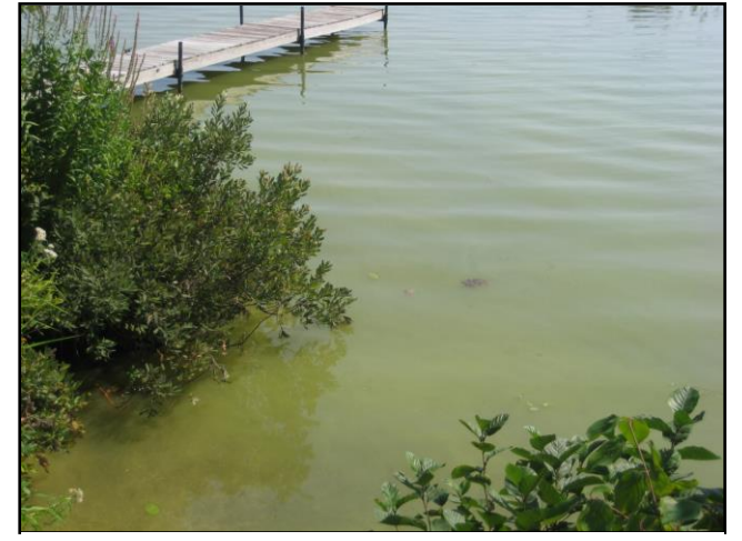
Dust Contains Phosphorus that Leads to Nutrient Loading and Algal Blooms.

Wind generation of dust particles can cause the erosion of valuable topsoil and contribute to the soiling and discoloration of personal property.