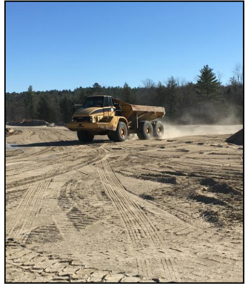
Training is a critical component to your fugitive dust control plan. Supervisors, workers, and subcontractors must be included in the training. Tailgate briefings are a key component of the training and should be held at the beginning of each day's work. Training should include reviewing the work activities and job site conditions that will create dust, the location of public and environmental receptors within the project area, the proper use of equipment and best management practices to prevent and control dust, and when to take corrective actions.