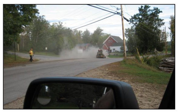
Dust Results in Poor Visibility & Driving Hazards

Dust restricts visibility at the job site and off-site. Reduced visibility creates a safety hazard to workers and to motorists passing by on adjacent roads.