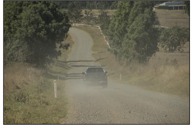
Poor Dust Control Leads to Poor Visibility & Driving Hazards

It is everyone's responsibility to monitor and note when activities and conditions are present that support the creation of dust. The dust control plan should be written so that everyone understands their duties, what best management practices must be followed, be authorized to take corrective actions to abate dust, and when to report adverse conditions to the project supervisor. Project